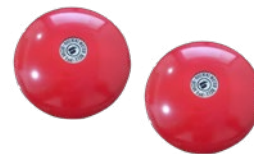
Hochiki Fire Alarm Bell

Part Number: CA-DCW-FM200 Voltage: 24VDC Ambient Temperature: - 25 - +70 Deg Dimintions (mm): H150 x W400 x D85 Material: Black Steel Finish Colour: Red