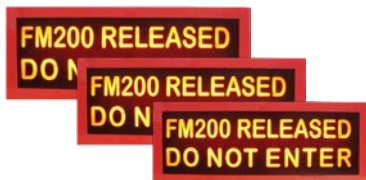
Canatech Discharge Warning Box

Part Number: CA-17ESB Voltage: 24V DC Current Consumption 24V DC (tone 3): 14.5mA Volume Control: 0 to - 20dB adjustment Ambient Temperature: -25°C ~ +80°C Material: ABS plastic Dimensions: 92.5mm(Dia.) x 110mm(H) Weight: 278g