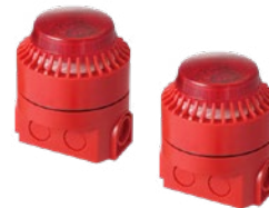
Canatech Electronic Sounder and Beacon

Part Number: 30-193000-001 Electrical Ratings: 2.5 Amps @ 120 Vdc Ambient Temperature: -13°F to 158°F (-25°C to 70°C) Shipping Weight: 2 lb. (.9 kg)