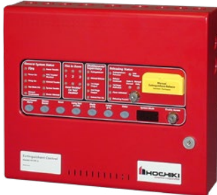
Hochiki Conventional Releasing Control Panel