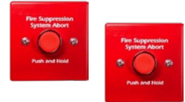
Hochiki Abort Switch

Part Number: HCVR-AS-R Switch Rating: 1A @ 30VDC Dimension: 3.81" W x 3.81" H x 2.32" D Finish Colour: Red