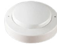
Hochiki ROR Heat Detector