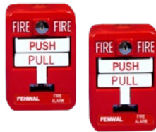
Manual Pull Stations Series 3300

Part Number: HPS-DAK-SR Contact: Form Contact Rating: 10A @ 120 VAC Temperature Range: -30°F~150°F (-35°C~66°C)