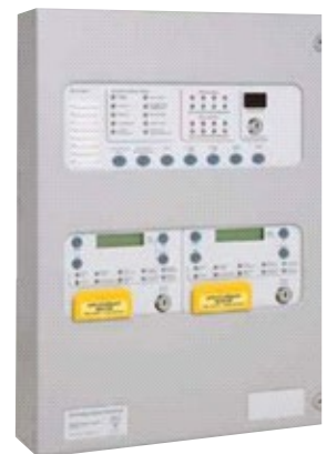
Kentec Multi-Area Releasing Control Panels