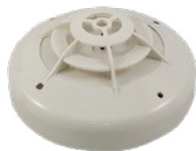
Hochiki Fixed Heat Detector