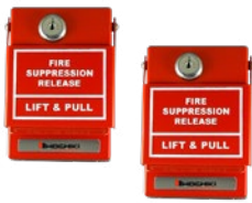
Hochiki Manual Pull Station

Part Number: HPS-DAK-SR Contact: Form Contact Rating: 10A @ 120 VAC Temperature Range: -30°F~150°F (-35°C~66°C)