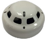
Hochiki Photoelectric Smoke Detector