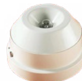
Hochiki Flame Detector